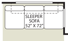
OPT. 807 SLEEPER SOFA